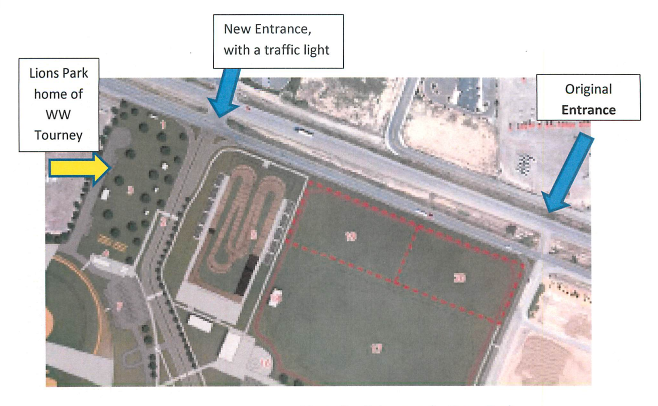
Mesa Co. Fairgrounds, Lions Park 2785 Highway 50, Grand Junction, CO 81503